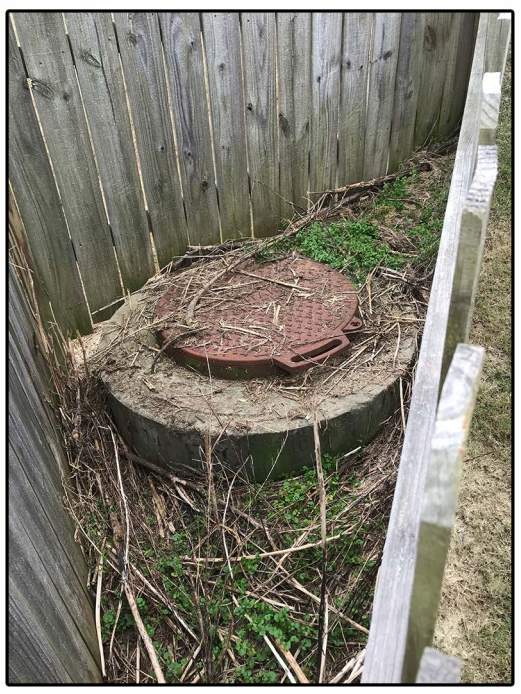
Example of Encroachment

Please refer to your Utility Easement Agreement to review all restrictions. When you purchased your property, you should have received a copy of the Utility Easement Agreement with your title report.