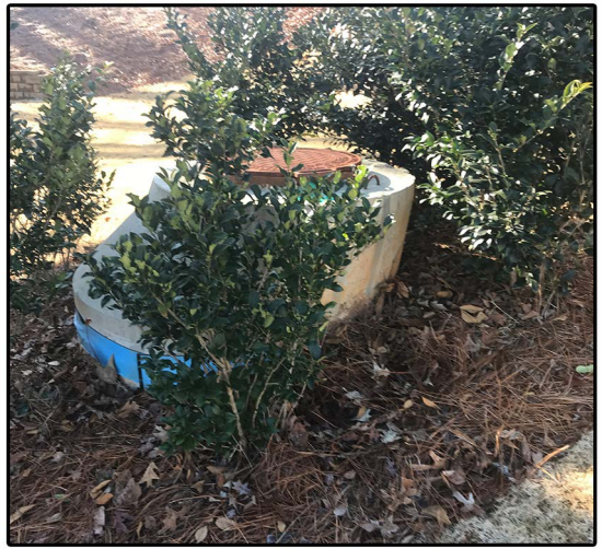
Example of Encroachment

In most cases, Forsyth County has the right, but not the obligation, to remove vegetation and any other obstructions that interfere with the use of the easement. The County may require the owner to remove or relocate encroachments at the owners' expense.